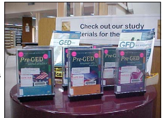
Pre-GED & GED DVD instructional videos

and GED preparations. Each set of five DVDs covers five subjects including language arts & reading, writing, math, science and social studies.