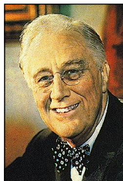
President Franklin D. Roosevelt

M oore Library is joining the History Channel’s effort to honor the late 32nd President Franklin D. Roosevelt who died 60 years ago on April 12. The library will have a display in commemora-